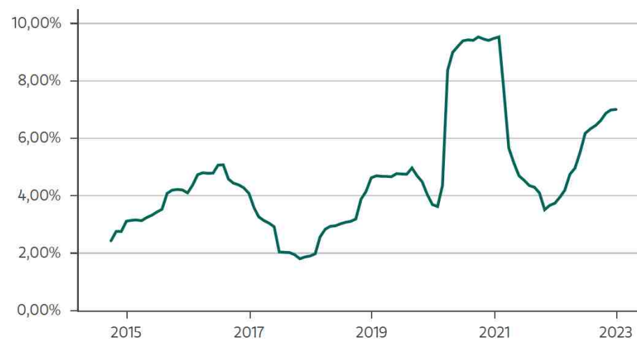
Rolling 12 month daily volatility