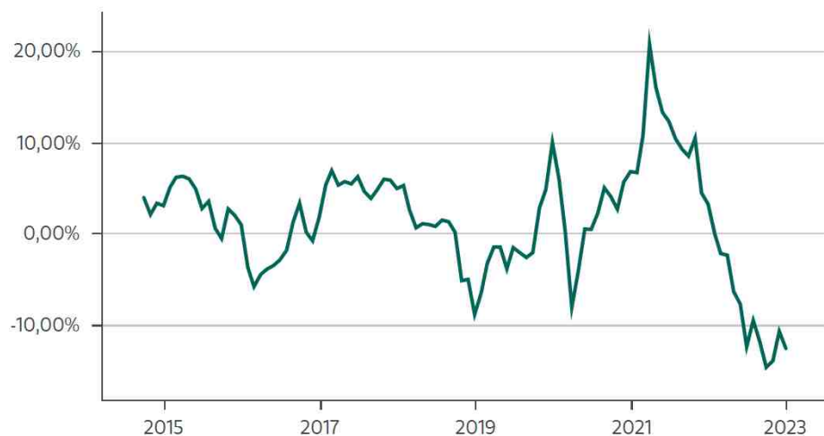
Rolling 12 month return

Return data as of 31/12/2022 net of fees.